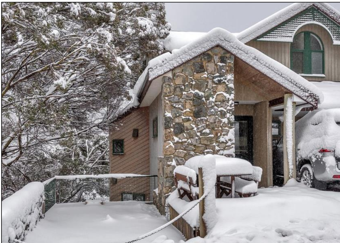
Figure 02: Subject site at No. 4A Diggings Terrace

The subject site is occupied by a four storey tourist accommodation building known as Melaleuca 1, which is semi-detached from Melaleuca 2 to the east.